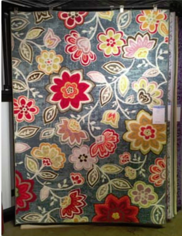
A design from Tayse's new Expressions line

went in two color directions at market with its rug collections. Bright, bold colors are the main theme in Joli, a group of traditional, abstract and global looks in vibrant colors using a space-dyed yarn, while Serena goes with neutrals in traditional and global ikat designs.