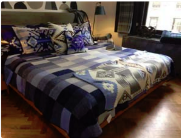
Pendleton's Boro Patchwork bed ensemble

Contemporary designs on offer, along with products to improve a night's sleep